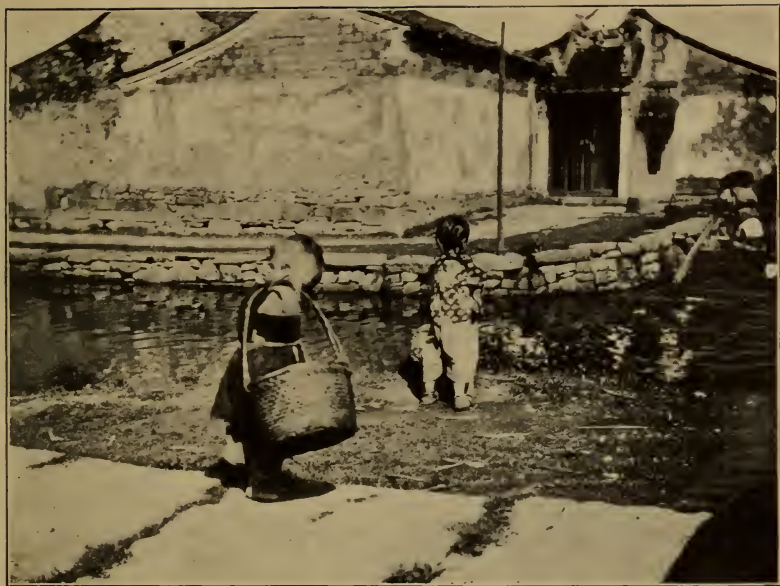
LITTLE OLD PEOPLE.